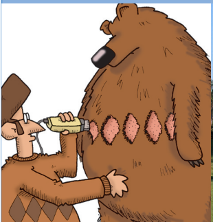
The Argyle Sweater