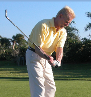
TJ Tomasi, Golf Insider