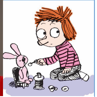
Cul de Sac