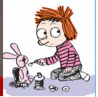
Cul de Sac